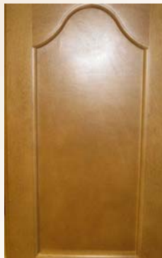
Cathedral in Maple Lane Wood