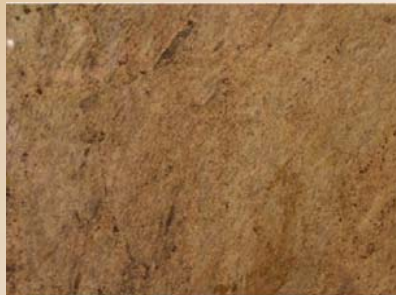
Madura Gold: Level 2