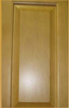
Square in Maple Grove