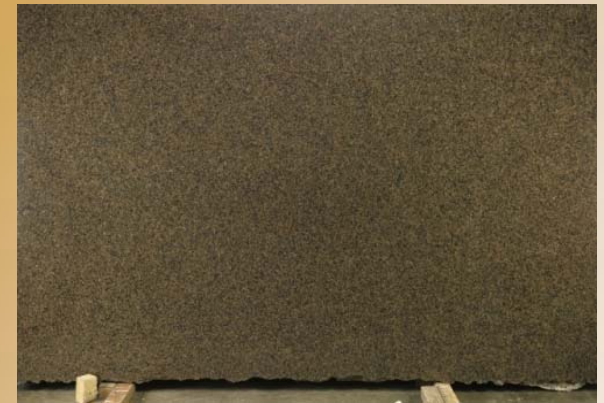
Tropic Brown: Level 2