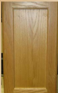
Square in Sherwood Oak