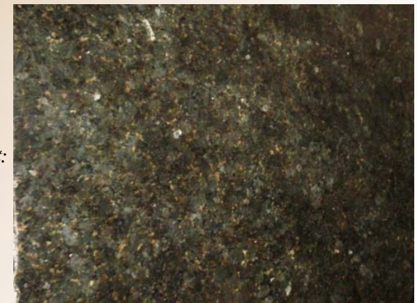
Verde Peacock: Level 1

Call today to schedule an appointment: (210) 764-1507