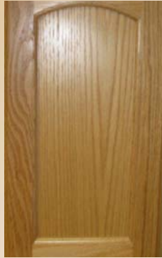
Arch in Sherwood Oak