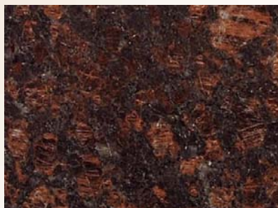
Tan Brown: Level 1