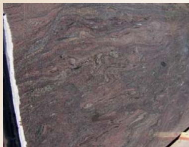
Paradiso Clasico: Level 2