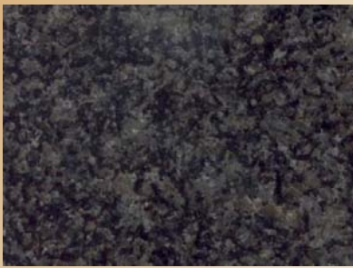
Black Impala: Level 2